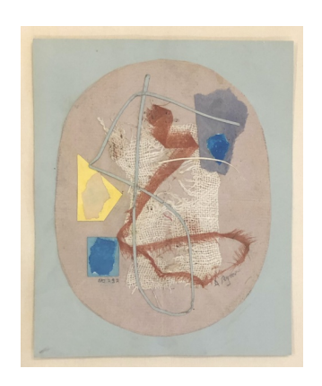
Anne Ryan (1889–1954) Untitled (No. 232) group C , c. 1948–1954 Collage on canvas paper 6.5 x 5.4 in. 16.5 x 13.7 cm