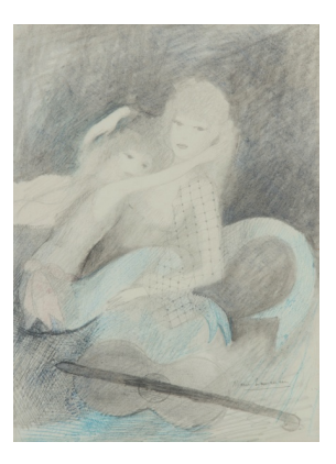
Marie Laurencin (1883–1956) Deux sirèns Crayon and pencil on paper 11.75 x 8.5 in. 29.8 x 21.6 cm