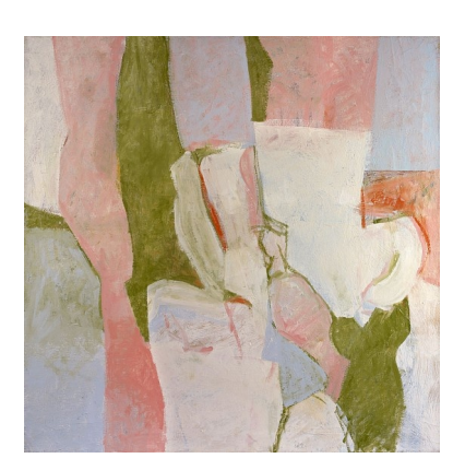
Charlotte Park (1918–2010) Untitled , c. 1960 Oil on canvas 34 x 34 in. 86.4 x 86.4 cm