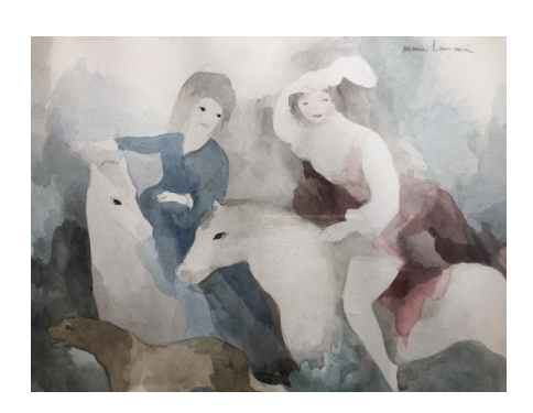
Marie Laurencin (1883–1956) Femmes d'équitation Watercolor on paper 9.5 x 13 in. 24.1 x 33 cm NFS