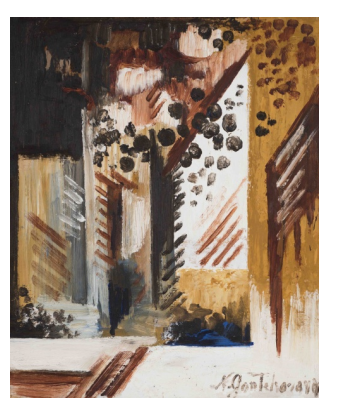
Natalia Goncharova (1881–1962) The village in brown and black: Rayonist composition, c. 1950 Oil on board 10.6 x 8.7 in. 27 x 22.1 cm