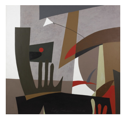
Esphyr Slobodkina (1908–2002) Untitled, conceived 1943, executed 1983 Oil on canvas 46 x 48 in. 117 x 122 cm