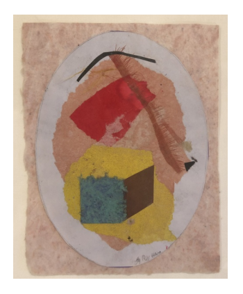
Anne Ryan (1889–1954) Untitled No. 324, c. 1948–1954 Acrylic and collage on canvas paper 5.5 x 4.5 in. 14 x 11.4 cm