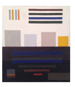
Alice Trumbull Mason (1904–1971) Paradox #10 Chiaroscuro, 1968 Oil on canvas 18 x 16 in. 45.7 x 40.6 cm