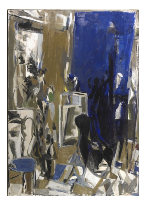
Janice Biala (1903–2000) Blue Interior, 1956 Oil on canvas 64 x 45.5 in. 162.5 x 115.6 cm