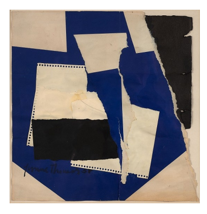
Yvonne Thomas (1913–2009) Collage , 1958 Collage on paper 14 x 13.5 in. 35.6 x 34.3 cm