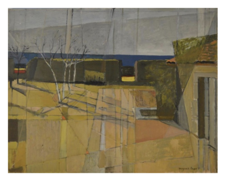
Marguerite Louppe (1902–1988) Le Buis, c. 1960 Oil on canvas 73 x 93 in. 185.4 x 236.2 cm