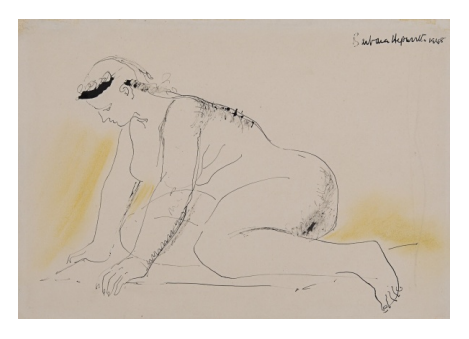
Barbara Hepworth (1903–1975) Crouching Figure, 1948 India ink and chalk on paper 9.25 x 13.25 in. 23.5 x 33.6 cm