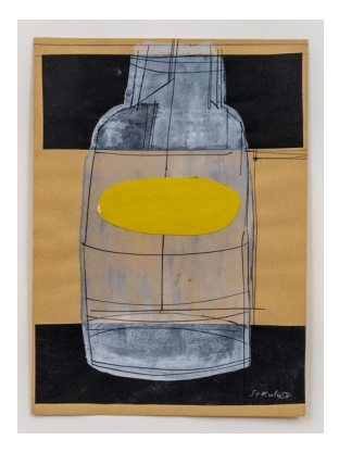
Sonja Sekula (1918–1963) Untitled (Bottle), 1958 Collage of several layers with gouache and ink on paper 8 x 5.8 in. 20.5 x 14. 8 cm