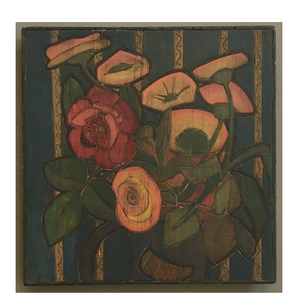
Blanche Lazzell (1878–1956) Petunias, 1926 Pigment on original woodblock 9.5 x 9.5 in. 24 x 24 cm