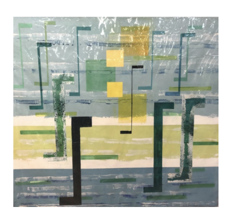
Irene Rice-Pereira (1902–1971) Spirit of Mercurius, c. 1958 Oil on canvas 50 x 56 in. 127 x 142.2 cm