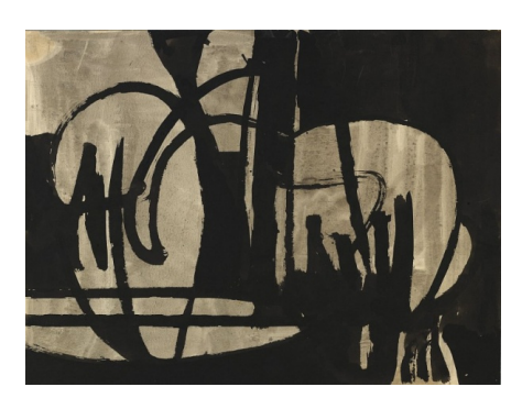
Charlotte Park (1918–2010) Untitled (Black and Gray IV), c. 1950 Gouache on paper 17.9 x 23 in. 45.4 x 58.3 cm