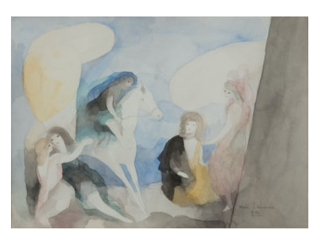
Marie Laurencin (1883–1956) Groupe de femmes et un cheval, 1927 Watercolor on paper 9.25 x 13 in. 23.5 x 33 cm NFS