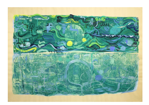
Sonja Sekula (1918–1963) Air , 1956 Opaque paint and ink on paper 18.3 x 26.2 in. 46.5 x 66.5 cm