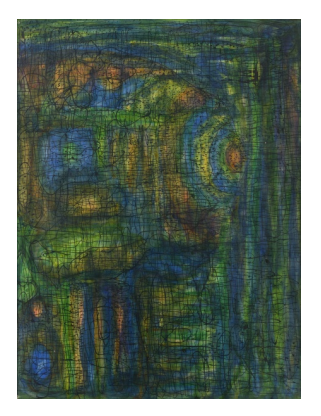
Fahrelnissa Zeid (1901–1991) Composition, c. 1953 Watercolor and ink on paper 19.7 x 13.8 in. 50 x 35.1 cm