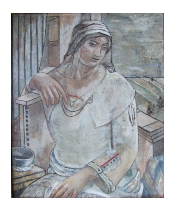
Isabel Bishop (1902–1988) Seated Woman, 1924 Oil on canvas 34 x 28 in. 86.4 x 71 cm