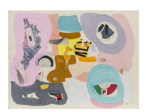
Beatrice Mandelman (1912–1998) Mexico, c. 1950s Collage and acrylic on paper 18.9 x 24.2 in. 47.9 x 61.5 cm