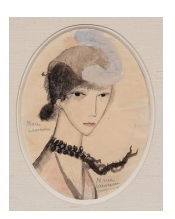
Marie Laurencin (1883–1956) Autoportrait, 1912 Watercolor on paper 4.9 x 3.5 in. 12.5 x 9 cm