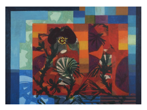
Eileen Agar (1899–1991) Untitled (Still Life ), 1966 Oil on canvas 28.8 x 39. 6 in. 73.5 x 100.5 cm