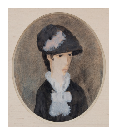
Marie Laurencin (1883–1956) Portrait de femme, 1905 Crayon and gouache on paper 6.3 x 4.7 in. 16 x 12 cm