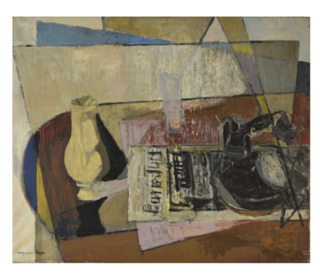
Marguerite Louppe (1902–1988) Telephone, Newspaper and Vase, c. 1940 Oil on canvas 60 x 81 in. 152.4 x 205.7 cm