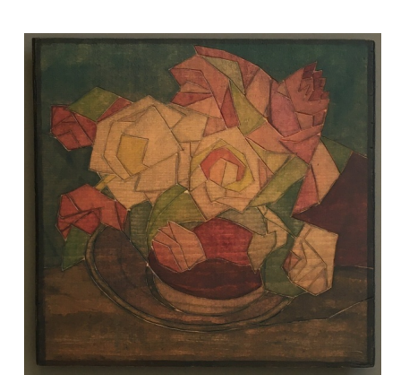
Blanche Lazzell (1878–1956) June Roses, 1926 Pigment on original woodblock 11.25 x 12 in. 28.6 x 30.5 cm