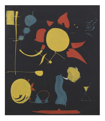
Perle Fine (1905–1988) Study for Fireworks, 1945 Gouache on board 23 x 20 in. 58.5 x 50.8 cm