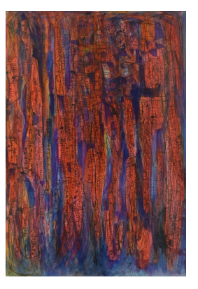
Fahrelnissa Zeid (1901–1991) Composition, c. 1953 Watercolor and ink on paper 18.5 x 14.2 in. 47 x 36 cm