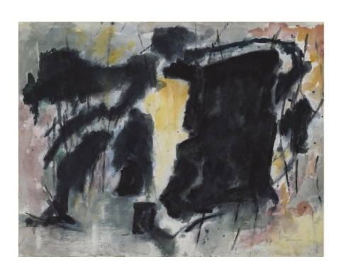
Alma Thomas (1891–1978) Untitled, c. 1960 Watercolor on paper 22 x 30 in. 56 x 76.2 cm