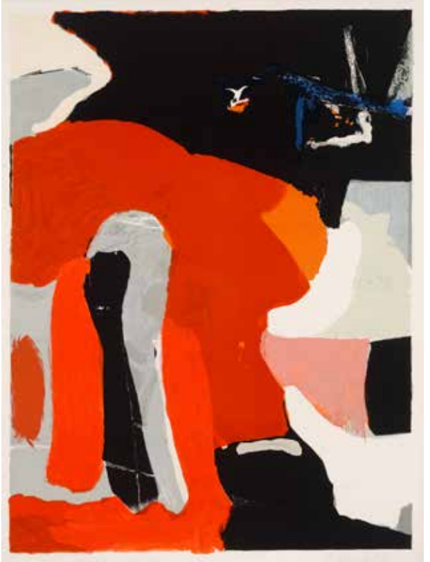
"James Brooks: A Painting Is a Real Thing" features a comprehensive survey of the artist's work comprised of over 100 paintings, prints, and works on paper.