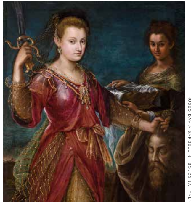
"Lavinia Fontana: Trailblazer, Rule Breaker" focuses on the late 16th-century Bolognese figure widely considered to be the first woman artist to achieve professional success beyond the confines of a court or a convent.

To reserve your advertising space, call today: 910.679.4402 Get Your Digital Subscription: ArtandAntiques.zinioapps.com